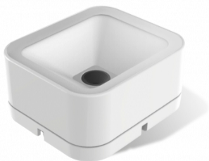
Available in white on request

Mindful that the FR27 Urchin can suit access control and kiosk applications, its case has a design that allows you to manipulate the cable for mounting portrait or landscape. It also has threaded fixing points for vertical mounting.