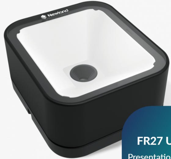
FR27 Urchin Presentation Scanners